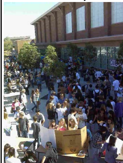
Above and Below: Students participating in Club Day during an Extended Lunch on Oct. 16th. Over 90 clubs are active on the CCA campus!