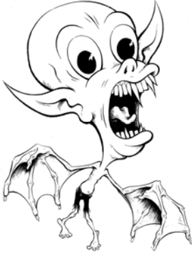
Bat Boy, the Musical, Logo design by: Tom Neely

Ripped from the headlines of The Weekly World News, BAT BOY: THE MUSICAL is a classic love story with a hilarious bite.