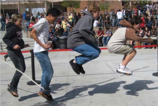
The KinderClash lunch competition revisited activities from elementary school to battle it out for lunch time supremacy!

Senior Passports remain on sale through the end of April for $120 with ASB card and $130 without. Senior Week activities include a Disneyland trip, a Senior dance, a Senior Barbeque and a Chipotle lunch!