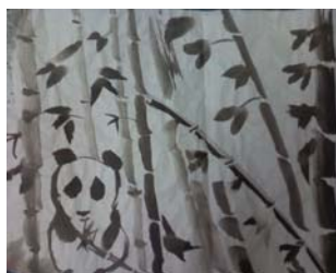
Art by :

Our energetic students volunteered and competed in this year's JCAP (Japanese Cultural Academic Proficiency) 2010 high school