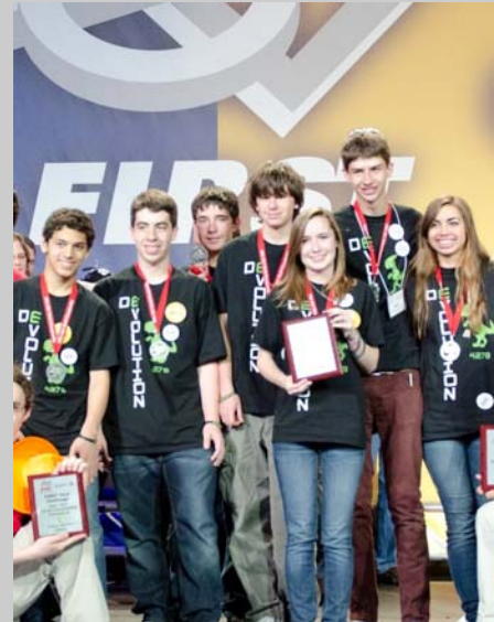
de.evolution with their alliance partners who helped them win 1 st place in their division.

The de.evolution team was supported by a number of local corporate sponsors, including: SAIC, ViaSat, Nordson Asymtek and Qualcomm.