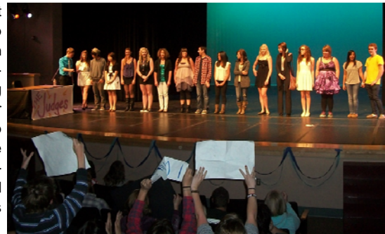
Above: Contestants from North County Idol