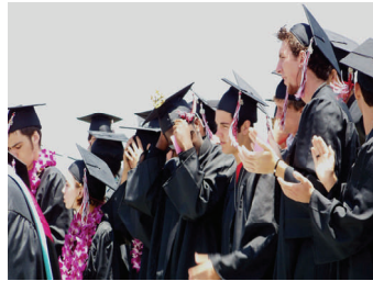
CCA Class of 2008.

CCA is also looking towards our own future and the excitement and challenges that may come. We emerged from last year's WASC process with a 6-year