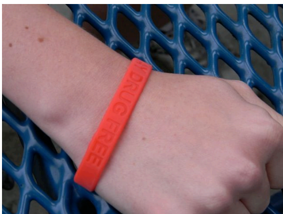
Red Ribbon Week