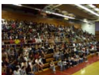
Youth Problem Gambling Assembly March 8th