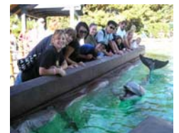
NHS officers' retreat at Sea World in November