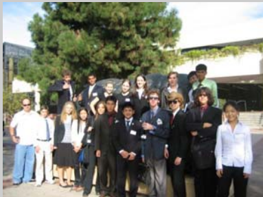
The Torrey Pines Model United Nations team is off to a great start this year! At the UCLA Model United Nations conference, delegates discussed diplomacy