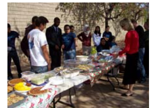
Good Eats at the AVID Luncheon!