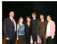
NHS Induction Ceremony