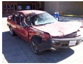
Reflections from Red Ribbon Week