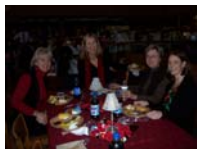
Winter Holiday Staff Party