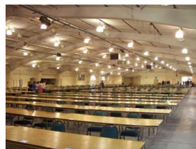
AP Testing Facilities at Del Mar Fairgrounds. 341 students tested for English Lit on May 9th.