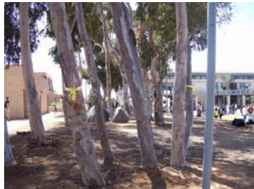
Yellow Ribbon Week