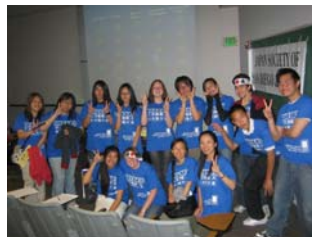
San Diego Regional Japanese Culture and Academic Proficiency Competition Winners!