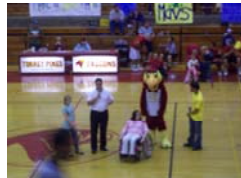
Make-A-Wish Charity Basketball Games vs. La Costa Canyon