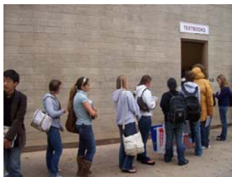
Long lines at the Textbook Room — See how to help on p. 8!