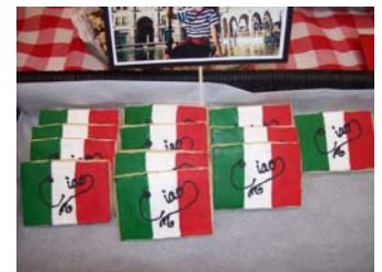
Staff Appreciation Luncheon