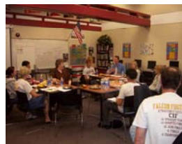
Campus Beautification Meeting