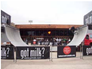
The Got Milk? Gravity Tour promotes the Campaign for Tobacco-Free Kids