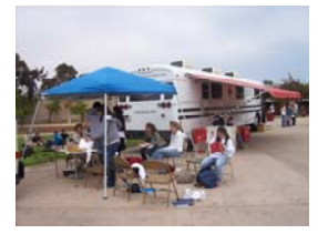
Bloodmobile visits Torrey Pines