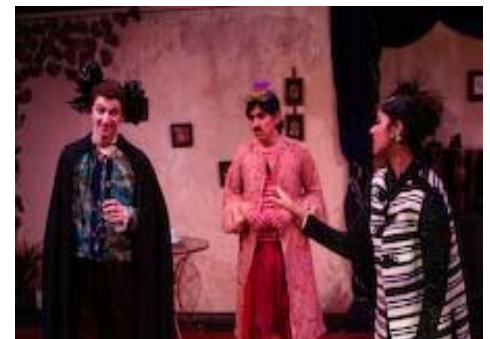
Thieves’ Carnival, 2007

We also want to make students feel like they have a place to go if they don't feel like they are a part of the school yet. Being a junior, and having been involved in the theatre department since freshman year, I can say I have met so many great people, and I have learned so much about theatre and about myself. I have gone from being ensemble, to a lead, to assistant stage manager, and presently light designer, and I have enjoyed every single role I have taken part of in this theatre. Considering the theatre is completely student-run, it gives students the opportunity to try any aspect of theatre, whether it be the lead of a show, or coming in on weekends to help build the set. We have been a family together and want our family as a theatre and arts department to expand with the talented students that haven't let themselves shine. We want to add