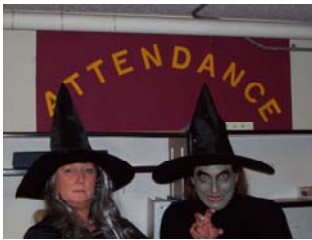
Our illustrious faculty and staff!