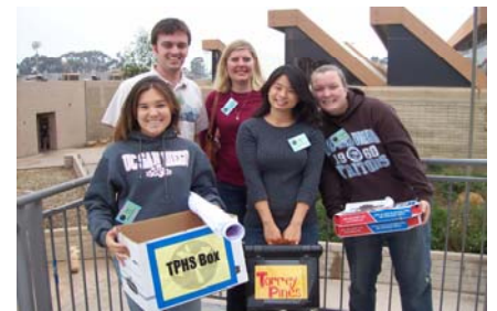
The Project Options Team from UCSD