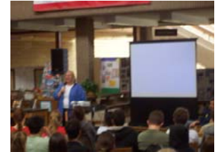
Cutting Edge Conversation with Emmy Award-winning producer Shannon McGinn