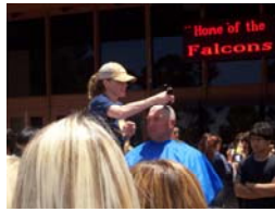
Looks Like Me