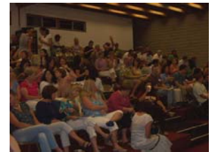
All Staff Meeting