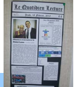
Newscasts and Newspapers in French, courtesy of AnneMarie Godfrey's Period 4 French III class