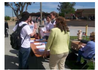
Dollars for Scholars accepted scholarship applications from TPHS Seniors, March 5th, 2010.