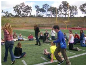
Best Buddies at Play