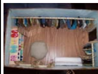
^ Scandinavian Walk-in Closet by Mandee Jang (9)

Jill Wong (9) shows her floor plan of a modern living room. >