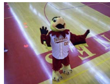
Freddie Falcon cheers at the APE Soccer Tournament