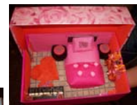
< Pink and Orange Bedroom by Michelle Hong (9)