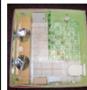
< Green Tiled Modern Bathroom by Anique Hermann (9)

Students in Ms. Hernandez' Interior Design class were given the project of creating a "Room in a Box" as their final exam. The assignment was to design and construct an actual 3-D model of a room of their choice based on their selected design style, to make a scaled floor plan, and then use this floor plan to build the room. Students drew on principles of design, such as color and texture, to create their rooms and their furnishings.