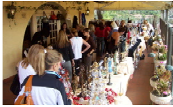
Holiday Boutique benefiting TPHS Foundation, November 29th