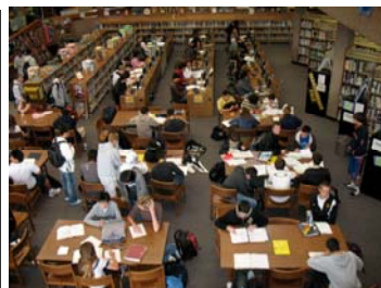
A Typical Lunch Time in the Library

Thanks to Friends of the Library, we're open Mon. - Thurs. 7:15 a.m. - 6:00 p.m. and Fri. 7:15 a.m. - 3:15 p.m.