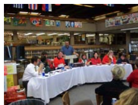
Admin. vs. Clerical

(clockwise from top left: Best use of horizontal stripes, Best use of vertical stripes, Best comeback (Last year's overall winner!), Best use of accessories and flair, and Best use of orange in a holiday sweater!)