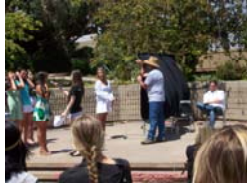
Singled Out, April 18th