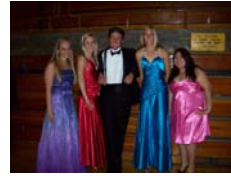
Prom Fashion Show