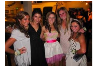
2010 Winter Formal, "A Sweet Escape," Air and Space Museum, February 6, 2010