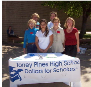
Dollars for Scholars Application Acceptance Day