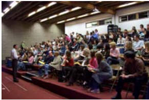
^ Incoming 9th Grade Parents' Nights