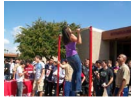
Pull Up Challenge