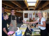
Making a delivery