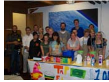
The TAP class

Students in the Transition Alternative Program (TAP) are enjoying their second round of success as they reopen the TAP Falcon Coffee Co. for the 2009-2010 school year. Started just a few months before school let out for the summer break, this student-run enterprise welcomes teachers and staff to come to room 1 for a variety of coffee and tea beverages on 1-3-5 days during break. Through The TAP Falcon Coffee Co., students are able to further expand their work experience opportunities while giving back to the program that has helped place and provide them with supported employment in the local community. Donations per cup go directly to the District's Workability Program which provides pre-employment skills training, worksite training and follow-up services for youth ages 12-22 in special education who are making the transition from school to work.