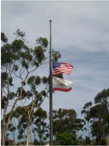
September 11, 2009