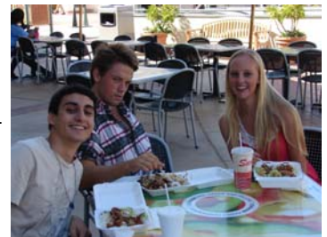
Torrey Pines Marketing students enjoy a lunch break at Fashion Valley Mall!

Students will follow-up next semester with a trip to University Towne Center stores! For more information about Marketing or Marketing II/ Internships, please feel free to contact any Marketing teacher!