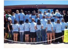
Students and Staff Support Looks Like Me