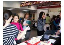
Summer Program Fair, February 25th