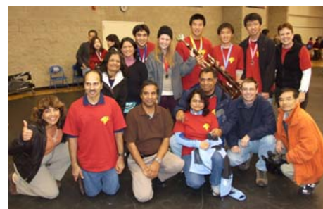
Seniors and Coaches