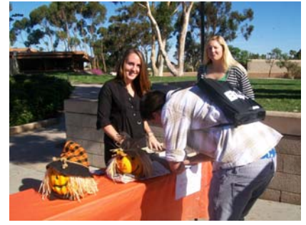
PALs sold Boo Grams at Halloween.