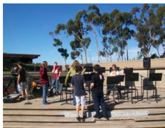
< Setting up