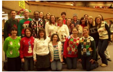
Staff Seasonal Sweater Spectacular Day!