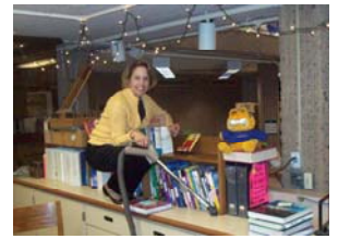
A Librarian's work is never done!