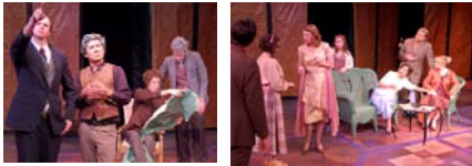
Scenes from "The School for Scandal"

Bravo to the Cast, Student Director, Designers, and Crew of "The School for Scandal." Not only did they have a successful run in November, they have been invited to perform a scene at the CETA (California Educational Theatre Association) Festival in January. They were selected from the Area IV schools who entered the adjudication process, and were one of the top 3 schools selected from our area! √