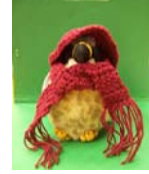
^ Falcon Spirit lives everywhere!!