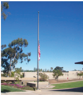
December 7, 2011