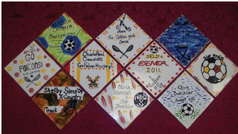
NAHS members recently finished wall tiles for the Girls Team Room.