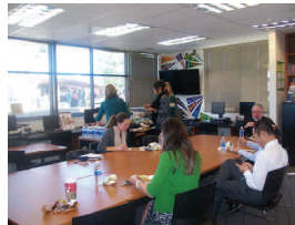
New Teacher Luncheon, 12/8