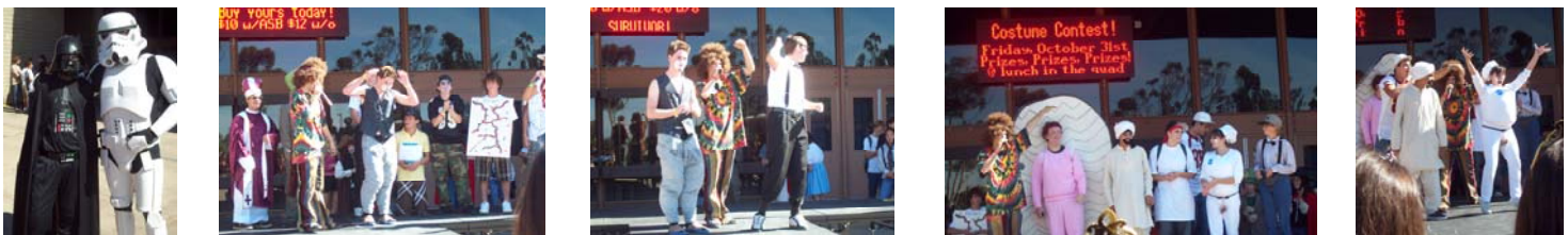
Some of our very creative students!