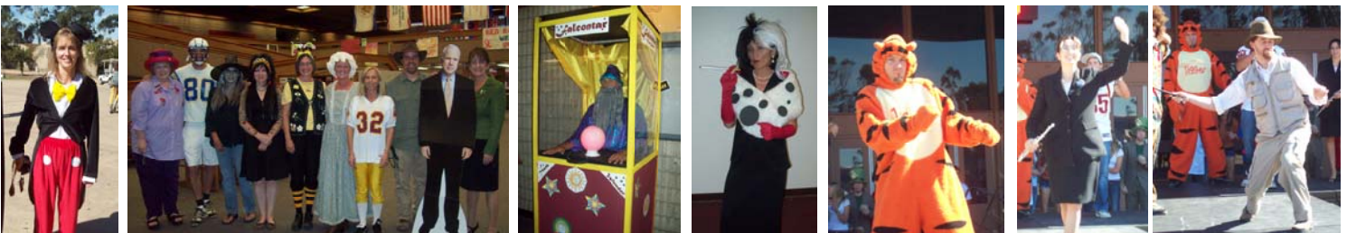
Some of our illustrious staff!