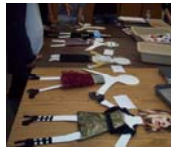
^ Fashion Design Class "Top Designer" Competition