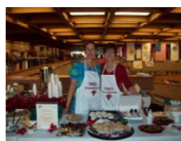
2008 TPHS Foundation Holiday Boutique