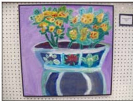
Library exhibit featuring artwork from St. Madeleine Sophie's Center